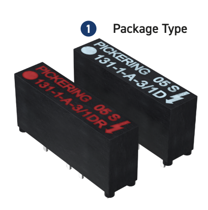
Text color option